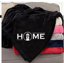
Shown with Design C

All proceeds from this sale will help fund a variety of High School Youth Events: (March for Life in DC, NCCY (National Catholic Youth Conference), etc.