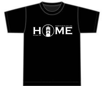
Shown with Design C