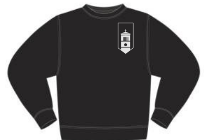
Shown with Design B