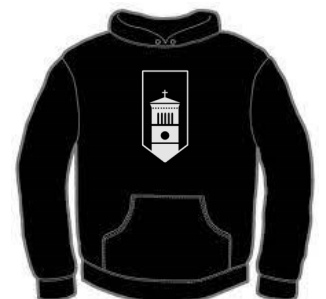
Shown with Design A