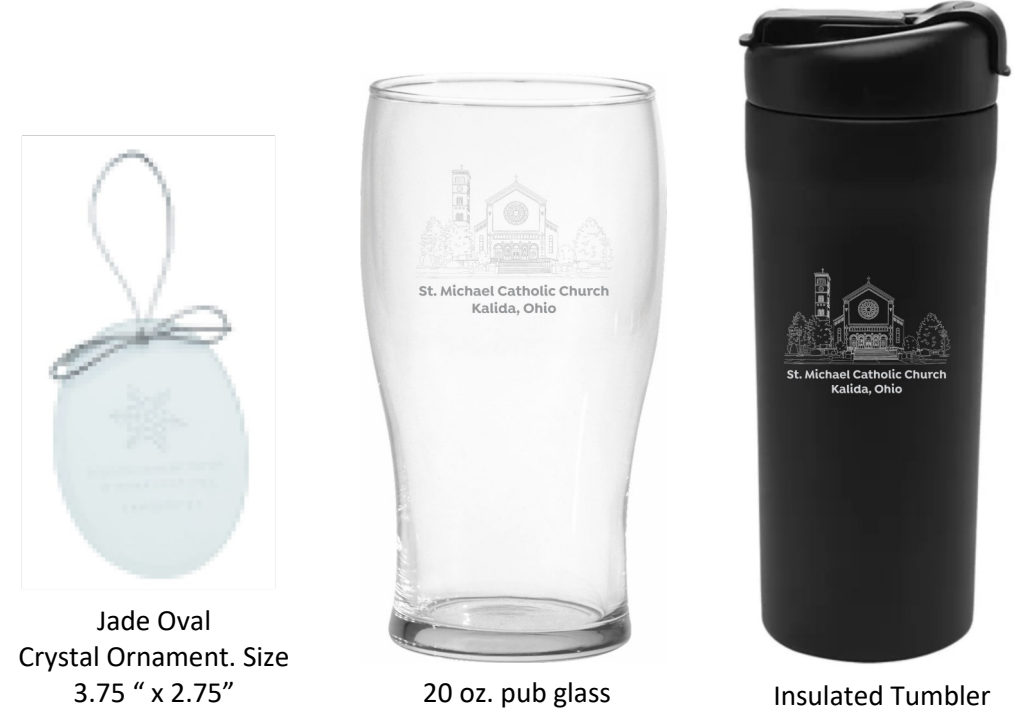
Jade Oval Crystal Ornament. Size 3.75 " x 2.75" 20 oz. pub glass Insulated Tumbler

To commemorate the 100 year anniversary of the church building, the parish is accepting orders for drinkware and an ornament engraved with the sketched image of the church. Turn in this completed form and payment to the parish office or place in the collection basket on or before Wednesday, March 18, 2026 . Make checks payable to "St. Michael's Church."