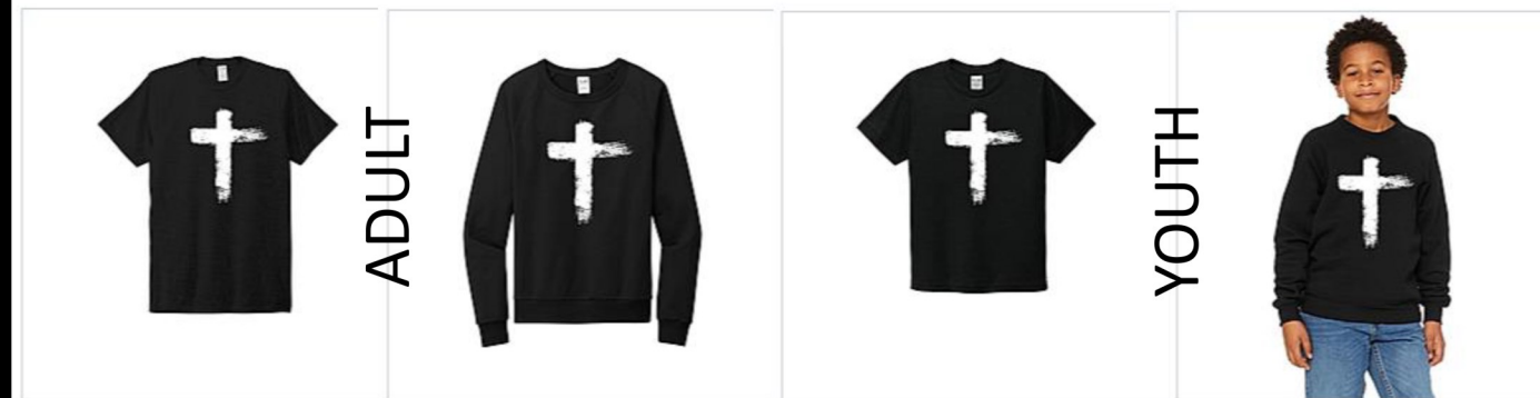
AllMade Unisex Tri-Blend Tee