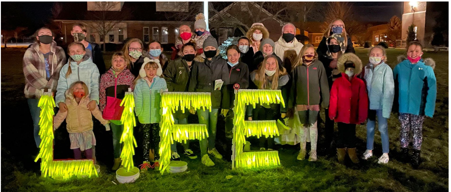
The Challenge Girls Club hosted a Prayer Service for Life on the anniversary of Roe v. Wade. Thank you to everyone involved.