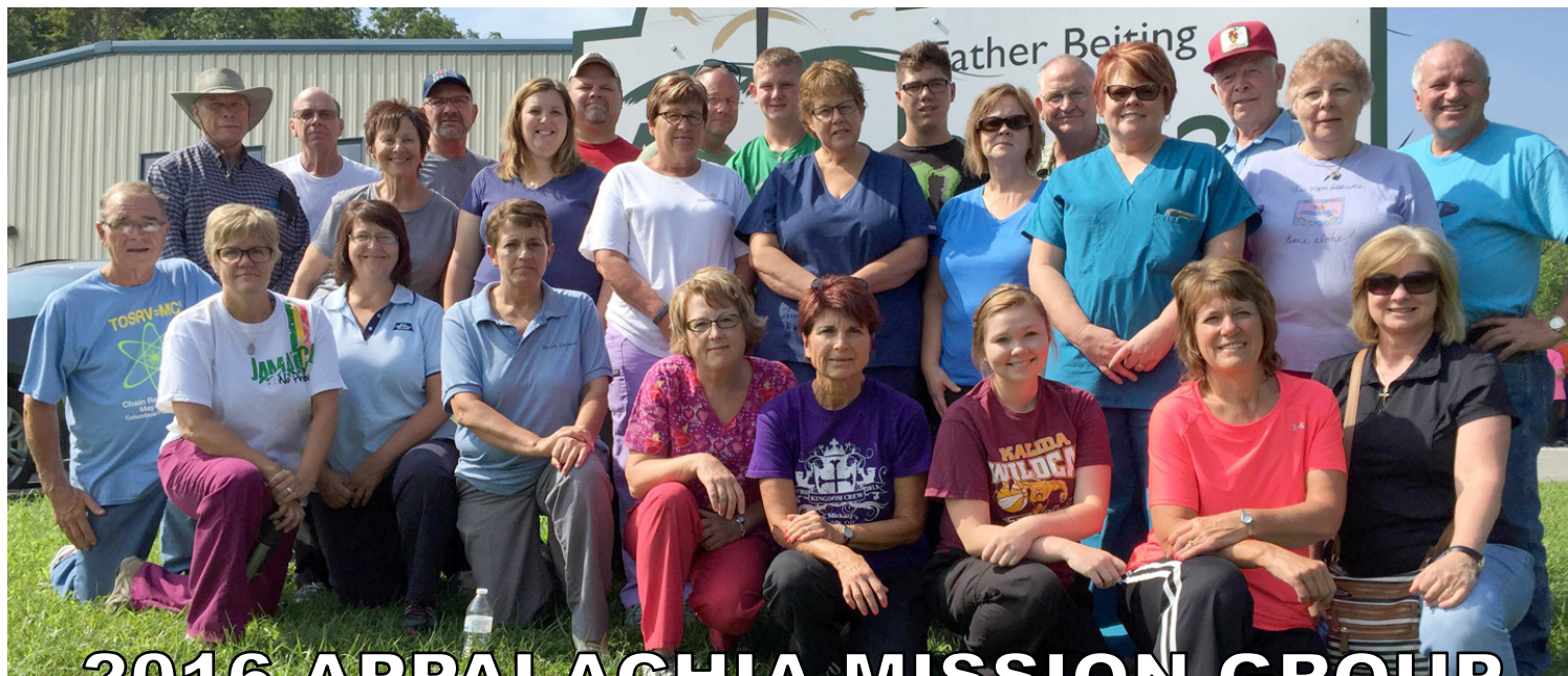
2016 APPALACHIA MISSION GROUP