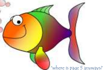
"where is page 5 anyways?"

Check out the fish fry coupon on page 5!!