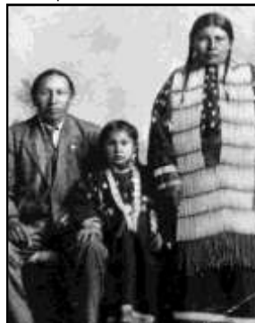
Black Elk, His wife and daughter in 1920

He fought at the Battle of Little Bighorn and later witnessed the death and destruction of the Minneconjou at Wounded Knee. These experiences could have led to a life of anger, hatred and despair.