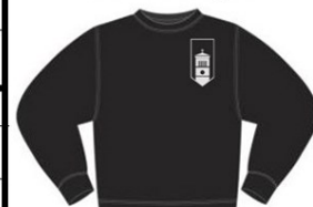
Shown with Design B