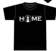
Shown with Design C