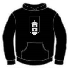
Shown with Design A