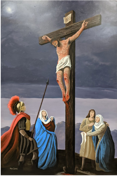
XII Jesus Dies on the Cross By Mike Sarka

People have asked how long the artwork of the Stations of the Cross will remain displayed around the block surrounding St. Michael’s Church. The stations will remain until Holy Saturday.