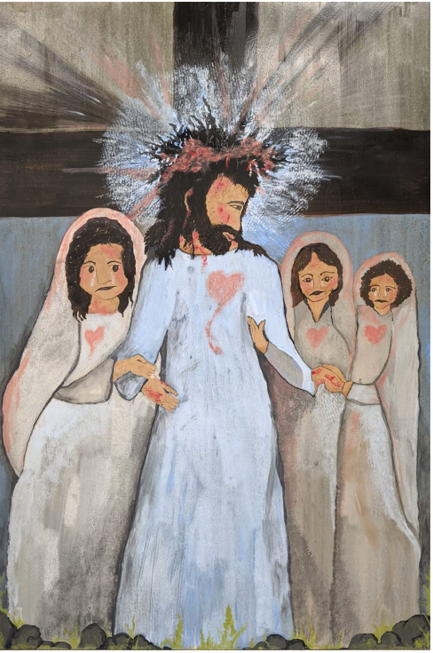
VIII Jesus Meets the Women By Ellen Millott