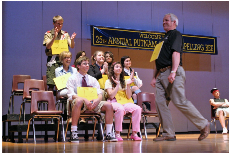
He participated in the High School Quiz Bowl, where the students would take on the teachers. He officiated over a mock ceremony of the marriage of “Q & U” the past couple of years, where they showed kindergartners how Q and U always go together. He also appeared in two productions (several years apart) of the High School Musical “25th Annual Spelling Bee.” To the left, he is shown strutting his stuff after spelling a word correctly. If memory serves us, it took them a little longer to get him out than anticipated!