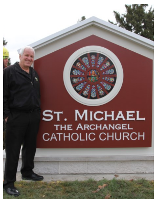
In 2020, an electronic sign was added to St. Michael’s Church yard.