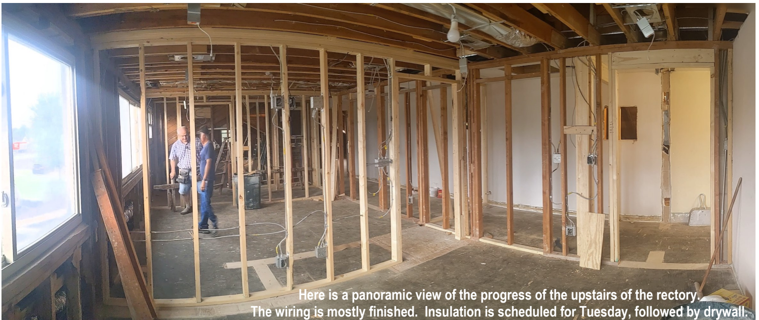
Here is a panoramic view of the progress of the upstairs of the rectory. The wiring is mostly finished. Insulation is scheduled for Tuesday, followed by drywall.