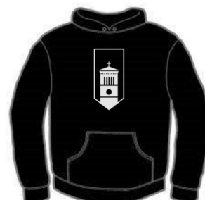
Shown with Design A