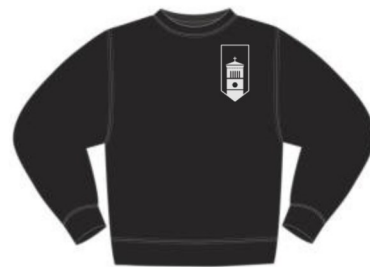
Shown with Design B