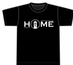
Shown with Design C