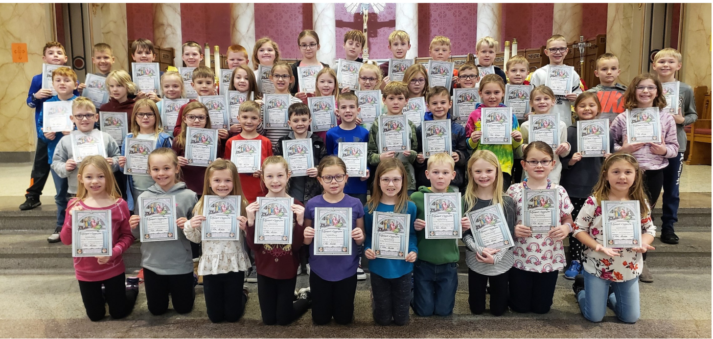
SECOND GRADE FIRST RECONCILIATION