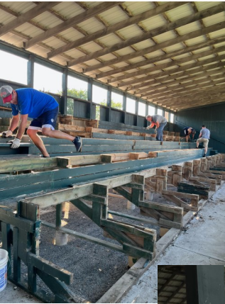
Photos of the deconstruction of the grandstand were submitted by Dennis Siebeneck.

The site is now prepped, and construction of a brand-new grandstand is set to begin – finally! This iconic corner will see a modern replica rise up, filling in the corner much the way it was, with new amenities, restrooms and a few fun fan surprises. The committee would like to extend a sincere thank you to the entire community for their support, generosity and patience during this process. Not only will this be a great place for baseball, it will beautify a prominent corner of the village and celebrate the site’s rich history.